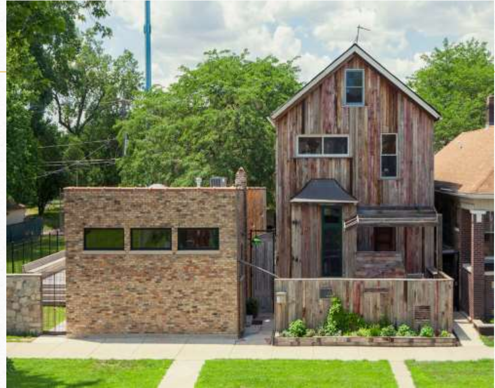
Rebuild Foundation. Chicago, IL