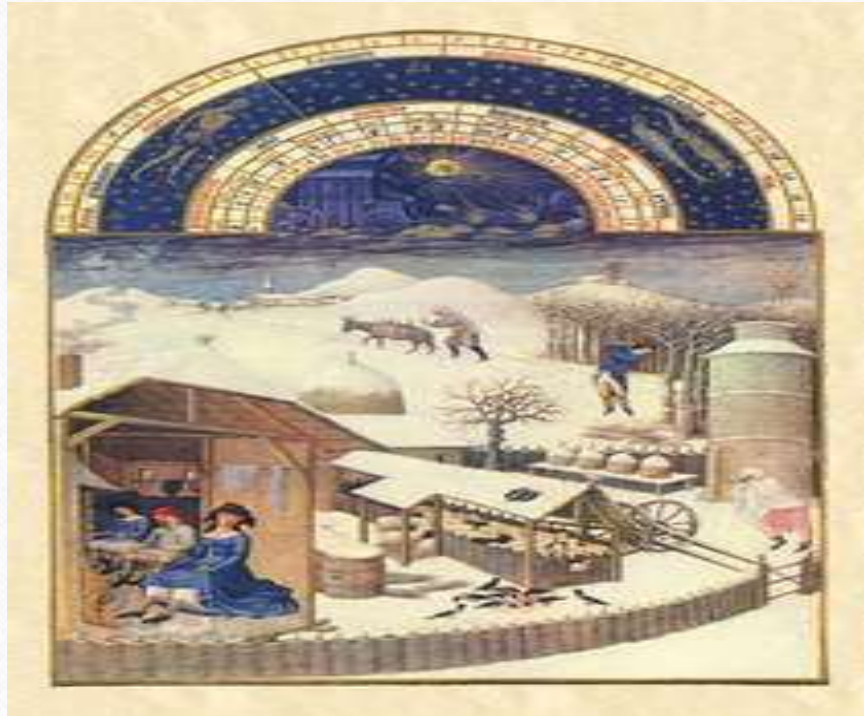
Limbourg Brothers. (1416) February , Les Très Riches Heures du Duc de Berry