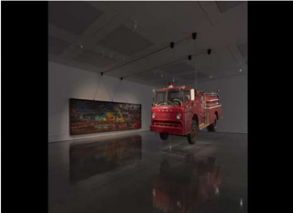
Theaster Gates. (2012) Raising Goliath