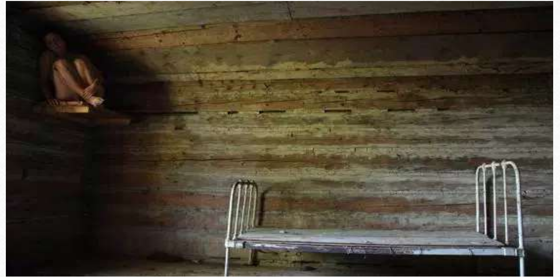
The True Stories Project: (2014) Oakland, California and Kathmandu, Nepal