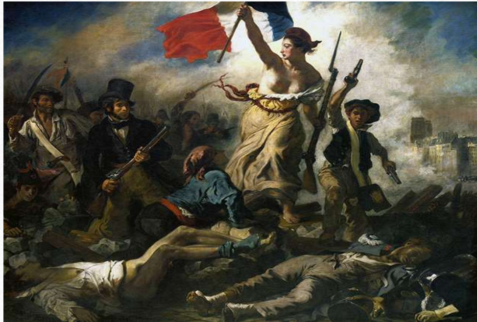
Delacroix (1830) Liberty Leading the People