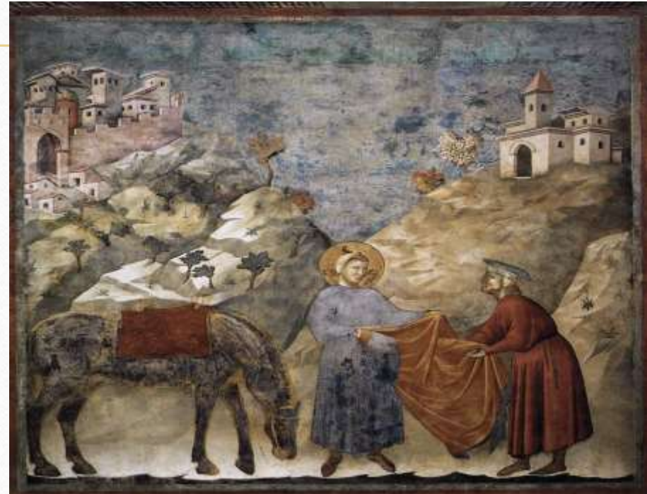
Giotto. (1297-99) St. Francis Giving His Mangle to a Poor Man and the Heavenly City