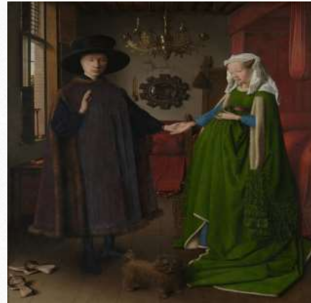
Jan van Eyck. (1434) The Arnolfini Portrait